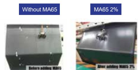
Fig 3 : Comparing extrusion sheet with and without Elastotech ® MA65